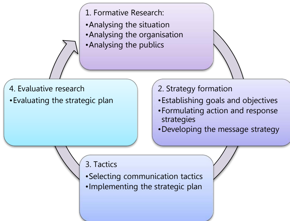
Figure 2: Four phases of strategic planning for a campaign

campaigns and are particularly relevant in media relations and crisis communication when the informational environment is congested. Techniques of framing, whereby practitioners work to construct a particular version of reality in the minds of target audiences and publics, are vital to key message development processes (Hallahan, 1999; Ihlen & Nitz, 2008). Perceptions of credibility originate in processes of the co-construction of meaning between public relations professionals and target publics, and are a result of all factors involved in the design, delivery and reception of key messages (James, 2011).